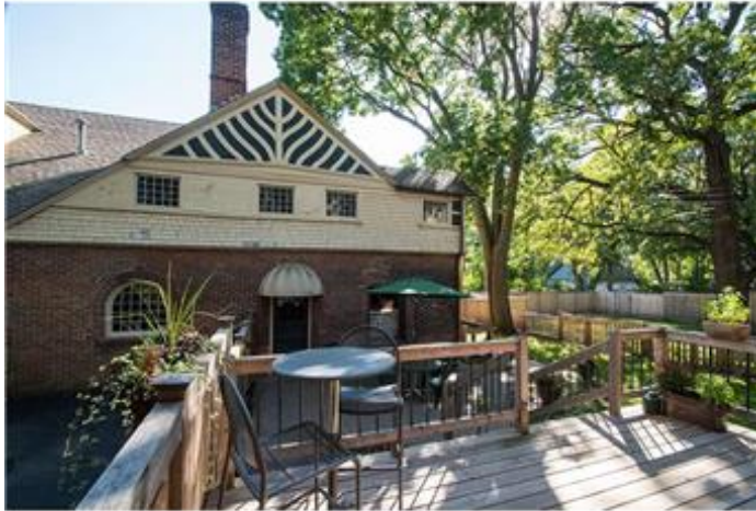
Back Deck and Carriage House.